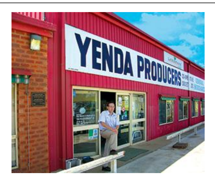
Yenda Producers Co-operative 2013