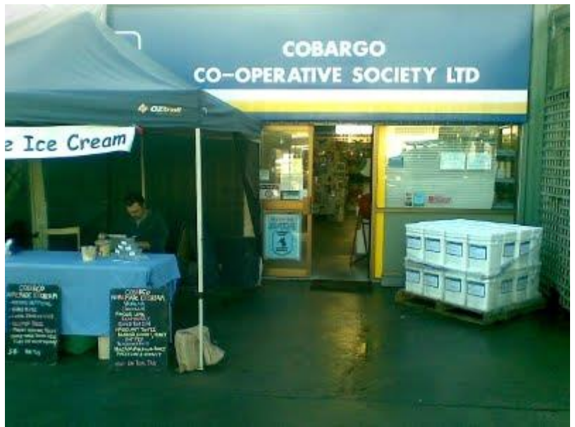
Cobargo Co-operative store entrance

The first two decades of the twenty-first century were marked by steady expansion as the cooperative consolidated its retail operations and progressively upgraded its facilities. This was necessary given the outlook caused by the dairy industry deregulation that had been underway throughout the 1990s and finally reached full implementation in July 2000 (Dairy Australia, 2019). By the early 2000s the co-operative owned several parcels of land within the Cobargo town site, which included its retail store and office, as well as an adjacent building used as a doctor's surgery. The co-operative store also served as a branch for the Horizon Bank, which is the trading name of the Horizon Credit Union Ltd.