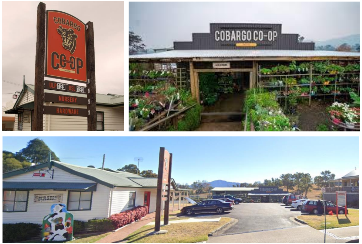
Cobargo Co-op site showing doctor's surgery, carpark, office, and store today

The following year the co-operative purchased additional land comprising a large property formerly owned by the McCarthy brothers. This contained a large house and was subdivided into several parcels of land. It had been somewhat controversial within the community as some people wanted the land developed for more retailing, while others felt that the house should be preserved due to its historical value. Over time the co-operative owned not only the building in which the doctor's surgery is located, but also other shops that they rented out as a hairdressing salon, clothing, and gift shop, and now a museum and tourist information centre.