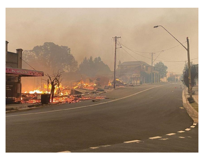
Cobargo main street ravaged by bushfires

"The aim of purchasing this parcel of land was to give us access to the back of the co-operative because the road that we have in runs between a laneway between the veterinary service and the old hairdressing salon which is our building. But the trucks must take a turn to get in, and they cross the highway and they block it. So, we were trying to guarantee that we would still have access, so we purchased another block of land down the bottom again (Tarlinton, 2020)."