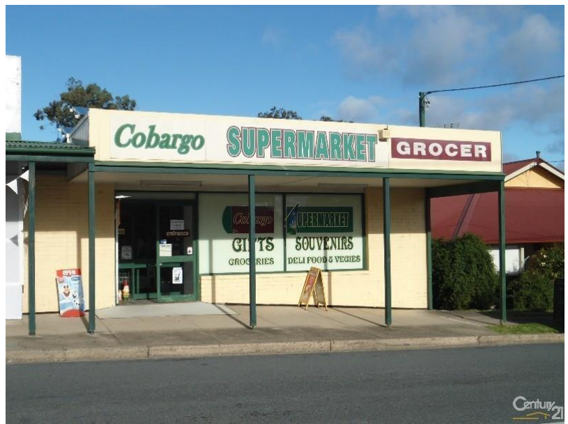
Cobargo supermarket entrance

would drive to Bega. Its owner had bought it for his daughters to run when he retired. However, they left to go to university, and so he continued run the business without them.