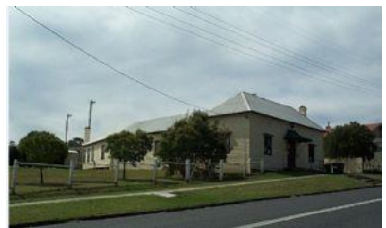
Cobargo School of Arts Hall

By the 1860s the township of Cobargo, also known as "The Junction", due to its location at the intersection of several creeks, had taken shape. A school was established in 1871 and this was quickly followed by the opening of a post office, general store, hotel, church, and blacksmith's workshops. As the community expanded, during the 1880s and 1890s the road infrastructure was upgraded along with the social, cultural, and commercial activities. This included the opening of a School of Arts (1887), the establishment of a Cobargo Agricultural Show (1889), and building of a new Post Office (1890), and then a Roman Catholic church (1898) that was built on land donated by the Tarlinton family (Cobargo Chronicle, 1941a). The School of Arts is a prominent timber building that was used regularly by the co-operative for its annual general meetings (AGMs). The building, which survives to the present, is now called the "Cobargo Hall", and is located at 18-20 Bermagui Road, where it is still used for community events (Bega Valley Shire, 2020).